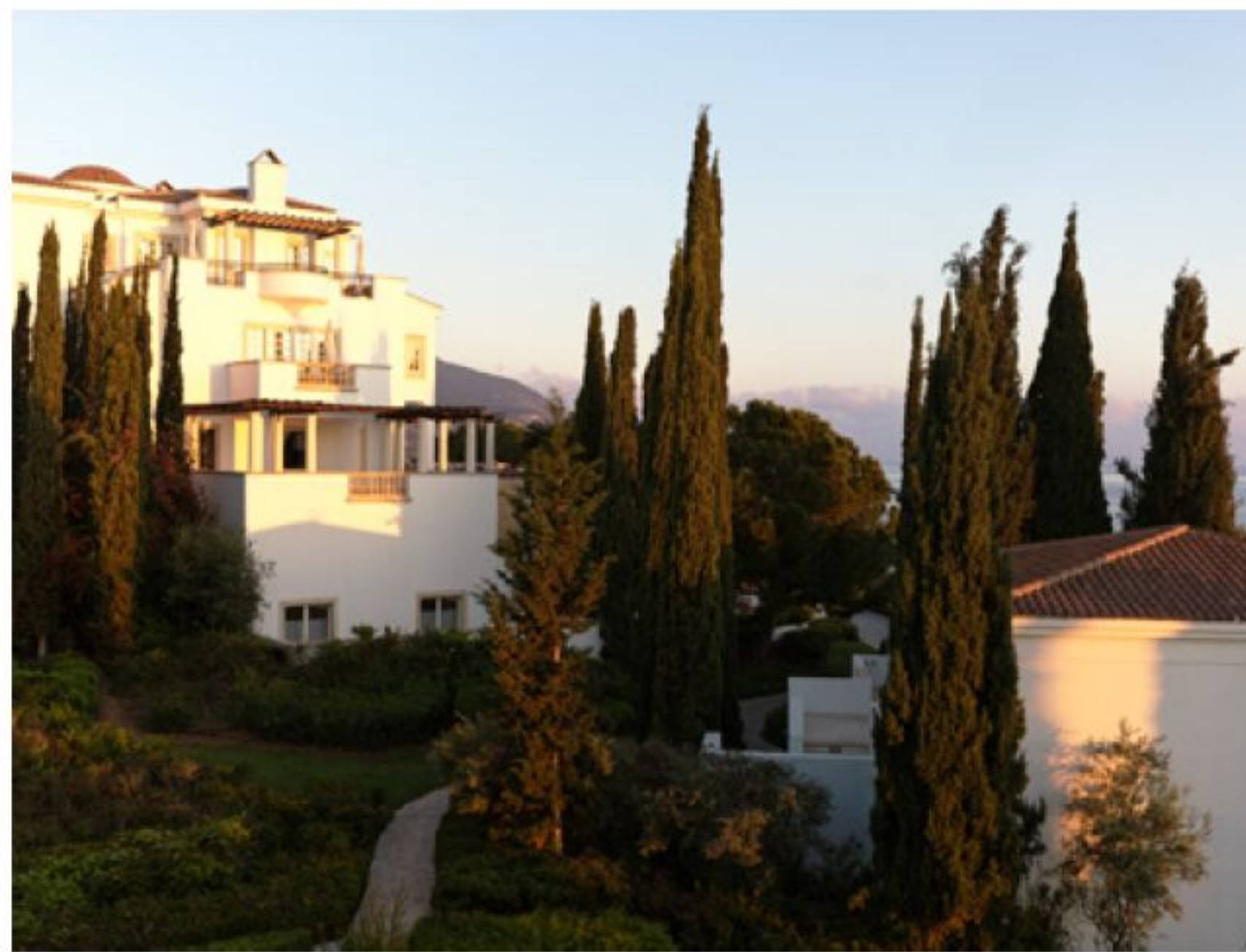
Left: enjoy the hotel's landscaped gardens and sea views. Below: interiors are light, bright and airy