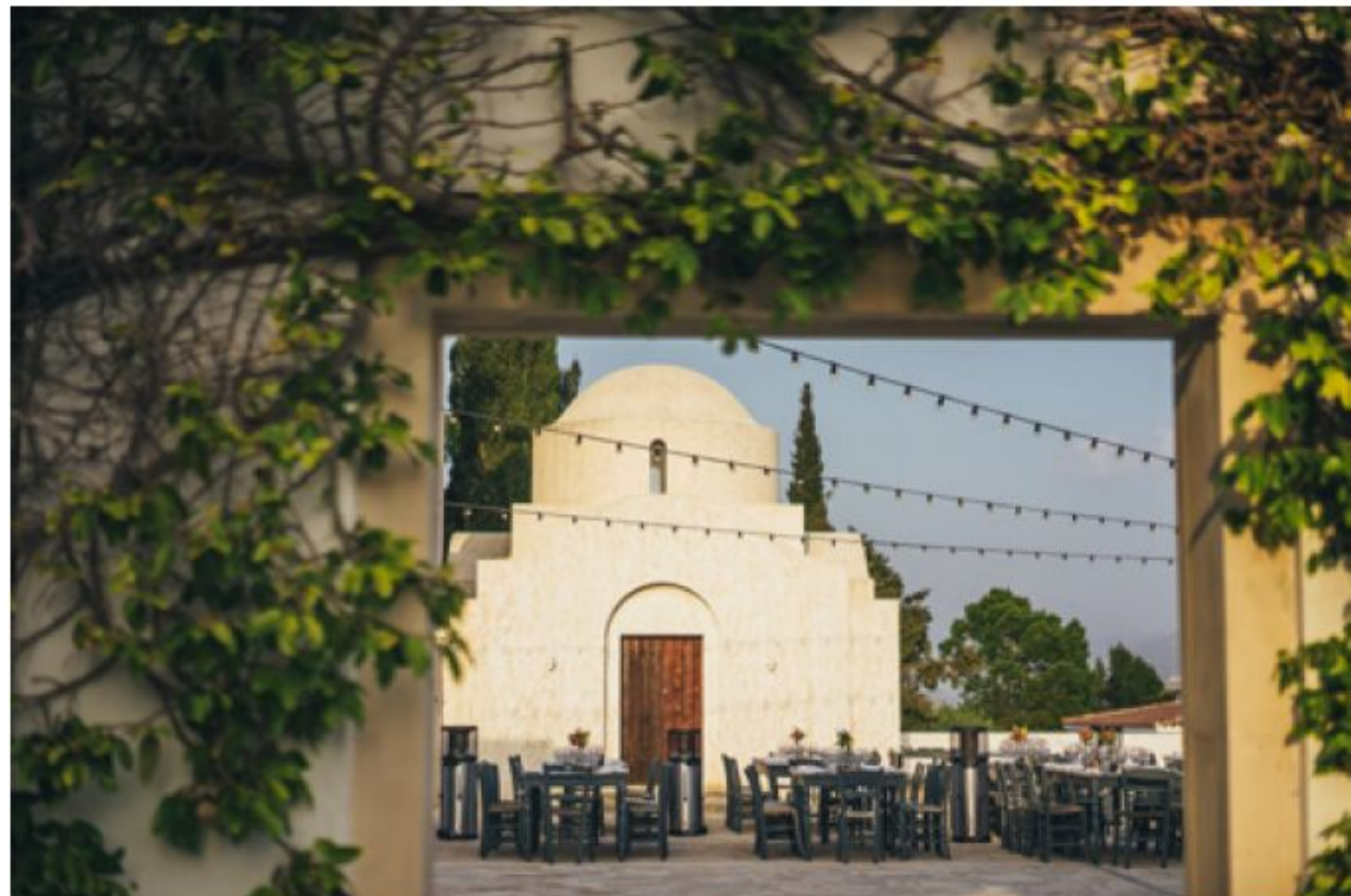
Right: Anassa boasts a beautiful hilltop location. Left: the 'Village Square'