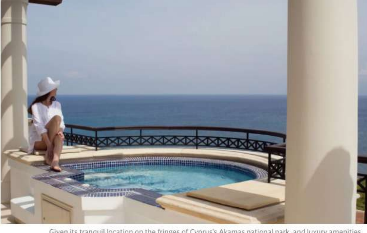
Given its tranquil location on the fringes of Cyprus's Akamas national park, and luxury amenities like a seriously opulent spa and gourmet cuisine, it is easy to see why celebrities flock to Anassa

By Sarah Conway 21 NOVEMBER 2019 - 3:53PM