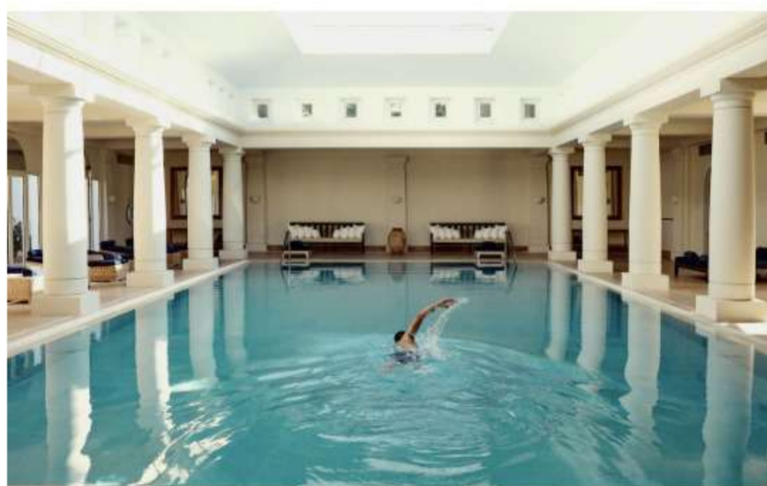
The Anassa's piece-de-resistance is its sumptuous Thalassa Spa, decorated in an elaborate Romanesque style and featuring a pool, saunas and steam baths

One reason for the influx of famous guests since the Anassa was founded 20 years ago is its fabulously out-of-the-way position. Cyprus can hardly be described as an unknown destination – every year, thousands of British holidaymakers flock to the beach hotels of Limassol, the popular resorts of Paphos and the gaudy bars and up-all-night clubs of Ayia Napa.