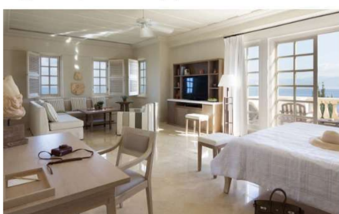
The 166 low-rise rooms and suites have been transformed into luxurious retreats presented in soothing neutral shades

There are no members of the Beatles or Duran Duran on the mornings I wander down to breakfast, although such is the laid-back atmosphere at the Anassa, with every guest left to do as much or as little as they want, that John Lennon, never mind Paul McCartney, could be sitting at the next table, and nobody would bother him. It is a haven where you can drift happily through the day without once noticing the passing of time; the hours dripping into the ether like one of Salvador Dalí's surreal melting clocks – 9am coffee and croissants in the Amphora restaurant blurring into a light lunch of seafood and salad at Pelagos, an al fresco taverna with tables on the terrace. An afternoon splash in the pool, with the built-in temptation of its swim-up bar, will quickly become dusk cocktails at Armonia – where the sounds of popping corks and amber nectars fizzing into long glasses help to salute the daylight at the end of its shift.