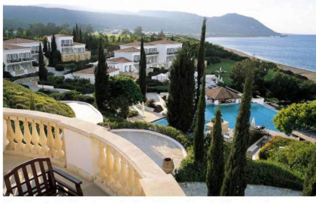
The whitewashed hotel gently cascades down to the sandy beach of Chrysochou Bay

But the deity who really knew how to make an entrance was Aphrodite. Legend has it that the goddess of love and beauty rose, fully formed and dazzlingly gorgeous, from the sea just off Paphos on the south-west coast of Cyprus – an ancient equivalent, if you will, of Ursula Andress stepping on to Laughing Waters beach midway through Dr No. Nor did she confine herself to what is now a small city and a holiday hotspot. The story continues that she picked a secluded spot on the nearby Akamas Peninsula – a cave where water pours from the rock amid the shadows of ceratonia trees – as her favourite place to bathe.