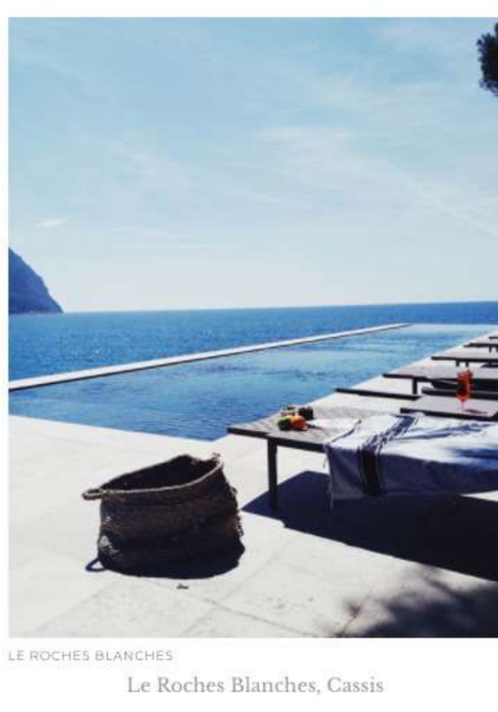
Le Roches Blanches, Cassis