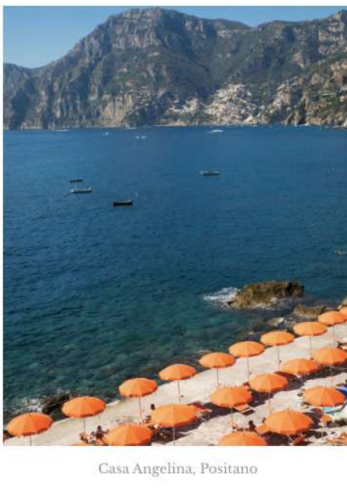
Casa Angelina, Positano