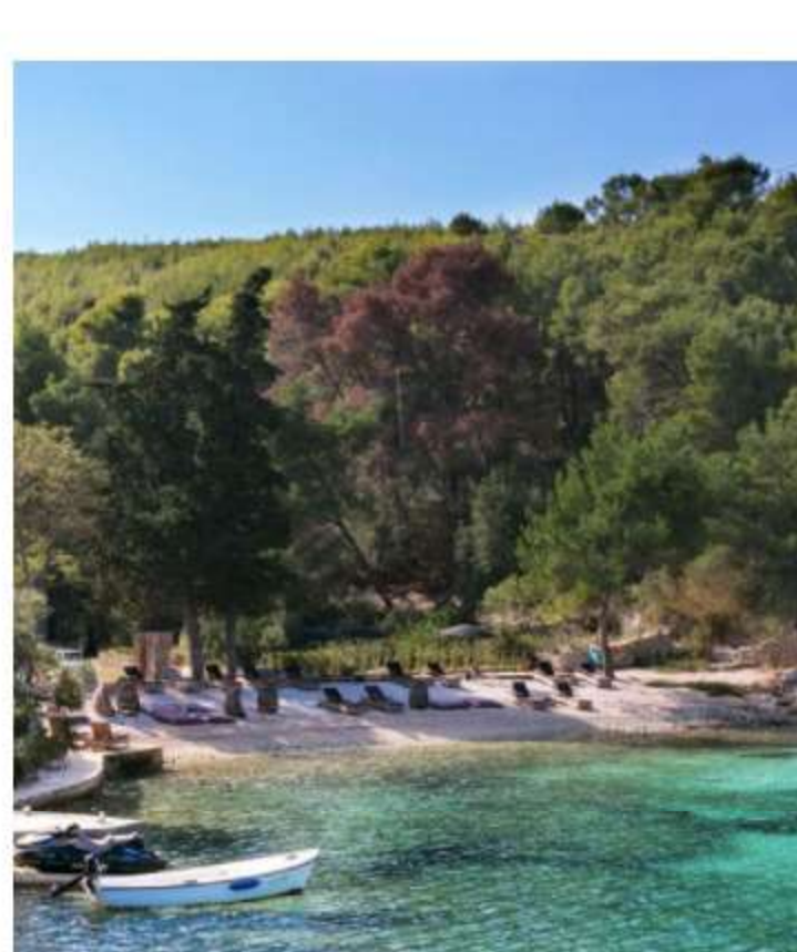
Little Green Bay, Hvar