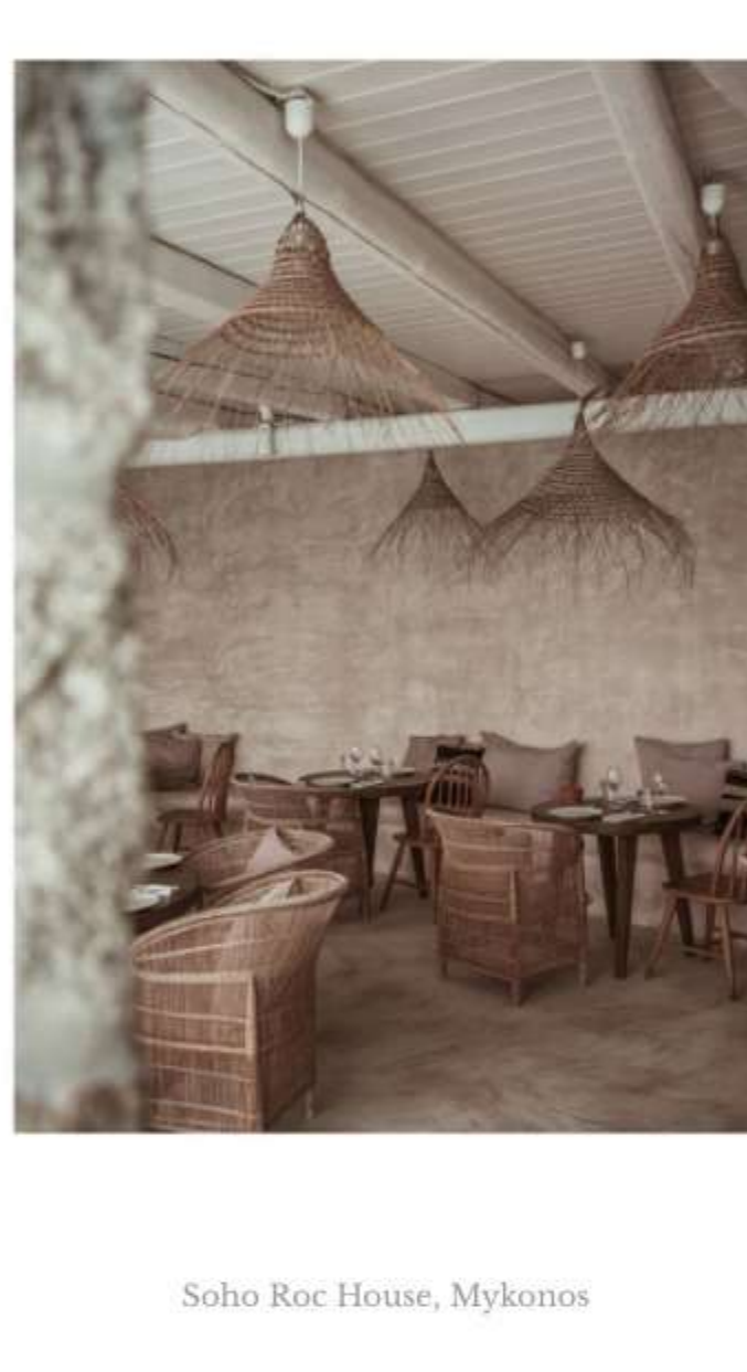
Soho Roc House, Mykonos