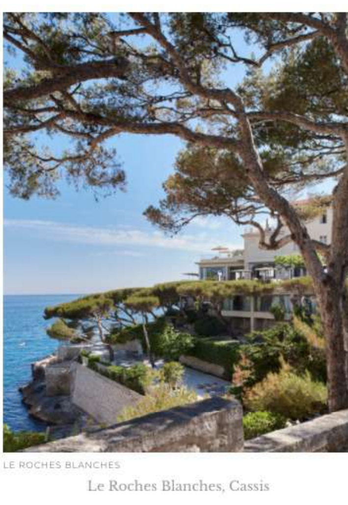
Le Roches Blanches, Cassis