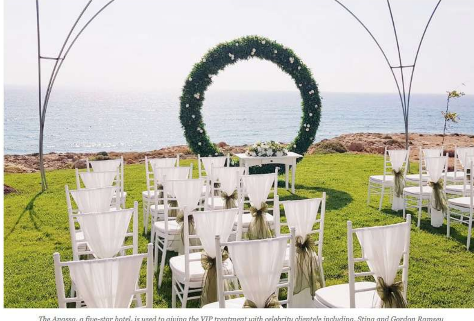
The Anassa, a five-star hotel, is used to giving the VIP treatment with celebrity clientele including, Sting and Gordon Ramsey

All good things must come to an end. But unlike other weddings where the following day your guests leave your venue with foggy heads and some left over wilting flowers, your guests will be left to lounge around the Anassa's five-star luxury pool or for those adventure junkies quad biking in the Akamas on their final day of luxury before dinner at their leisure and their final night of this magical wedding experience.