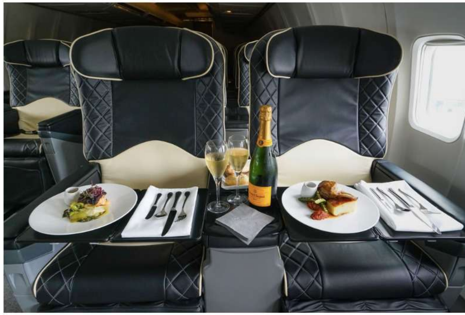
This dynamic package will fly you and your wedding party by a private all business-class Boeing 737 direct to Paphos; home to the island of love, Cyprus

Like all great wedding's abroad, a cocktail reception and dinner will be hosted for you and your guests on the evening of your arrival, leaving you all to unwind relax and get to know each other before the wedding day itself. But the party need not get carried away as the following day, guests will be collected by a private luxury coach and taken to a local winery for a tour of the winery, wine tasting followed by a traditional Cypriot lunch.