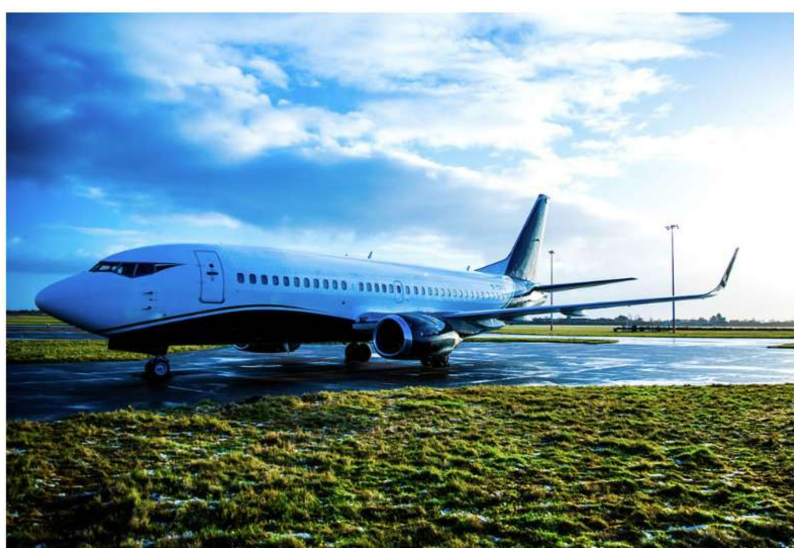
You and your guests will check-in at the private jet terminal at Stansted airport

With guaranteed sunshine, crystal-waters, breathtaking views and delicious cuisine, all the stressful parts of your wedding planning will be taken away with the help of With This Ring; a Cyprus based wedding planners who help make your dreams a reality. And with so many bride and grooms saying that their big day went too fast – this incredible deluxe package sees your wedding celebrations last five glorious sun-soaked days.